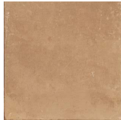
Cotto Rosso Non-slip 59,2x59,2 cm - 23,3"x23,3"