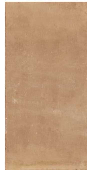
Cotto Rosso Natural 50x100 cm - 19,69"x39,37" G-3140