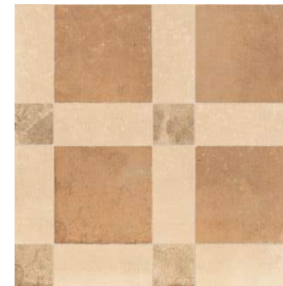
Cotto Stamp Natural 59,2x59,2 cm - 23,3"x23,3" G-3158