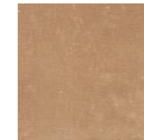
Cotto Rosso Natural 30,5x30,5 cm - 12,01"x12,01" G-3114