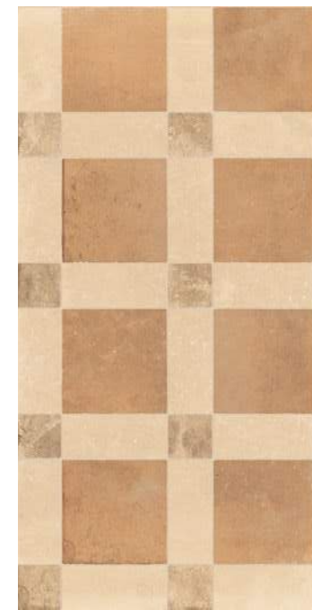
Cotto Stamp Natural 50x100 cm - 19,69"x39,37" G-3162