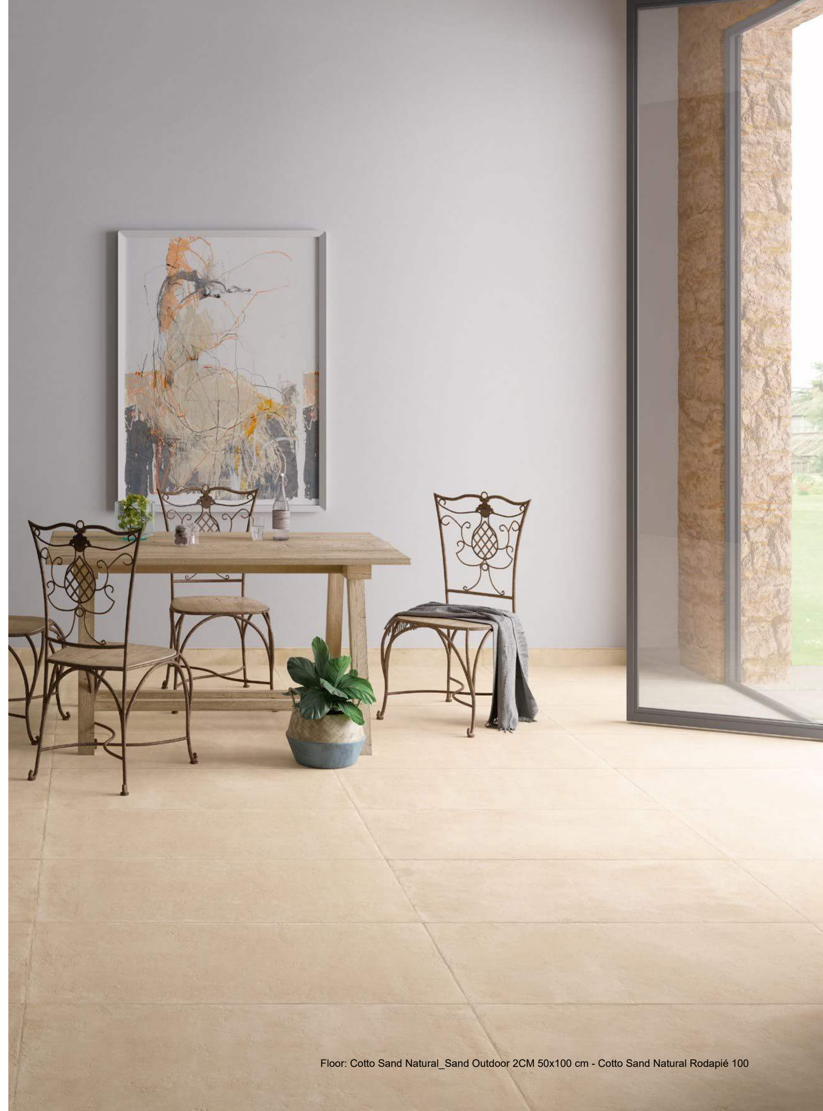
Floor: Cotto Sand Natural_Sand Outdoor 2CM 50x100 cm - Cotto Sand Natural Rodapié 100