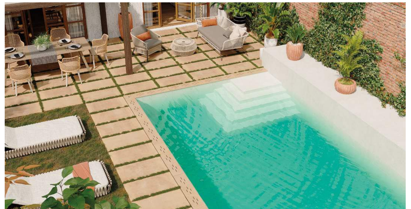
Floor: Cotto Sand Natural_Sand Outdoor 2CM 50x100 cm - Cotto Sand Natural Outdoor 2CM Grid