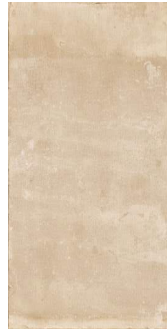
Cotto Sand Outdoor 2CM 50x100 cm - 19,69"x39,37"

Porcelain Straight Edge Moderate Variation Thickness 2 CM Porcelánico Ángulo Recto Moderada Variación Espesor 2 CM