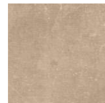
Cotto Brown Natural 30,5x30,5 cm - 12,01"x12,01" G-3114