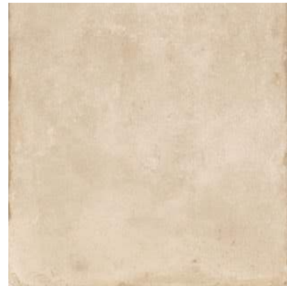
Cotto Sand Non-slip 59,2x59,2 cm - 23,3"x23,3"

Porcelain Straight Edge Moderate Variation Thickness 1CM Porcelánico Ángulo Recto Moderada Variación Espesor 1CM