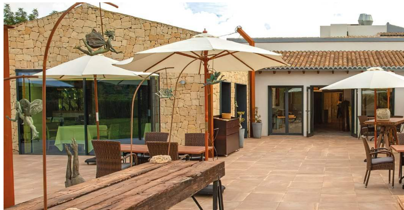
BONAMB RESTAURANT | Jávea, Spain