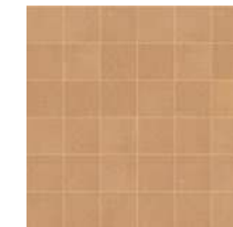
Cotto Rosso Natural Mosaico 5x5 29,75x29,75 cm - 11,71"x11,71" G-3558