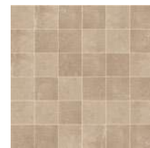
Cotto Brown Natural Mosaico 5x5 29,75x29,75 cm - 11,71"x11,71" G-3558