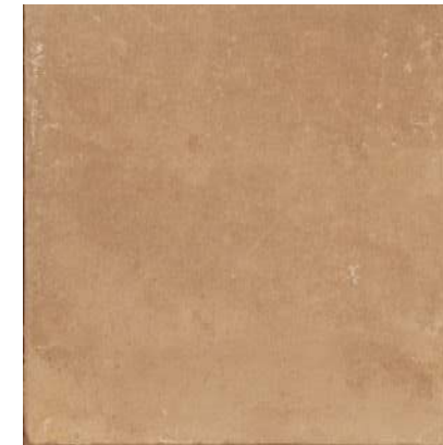
Cotto Rosso Natural 59,2x59,2 cm - 23,3"x23,3" G-3132