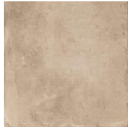
Cotto Brown Non-slip 59,2x59,2 cm - 23,3"x23,3"