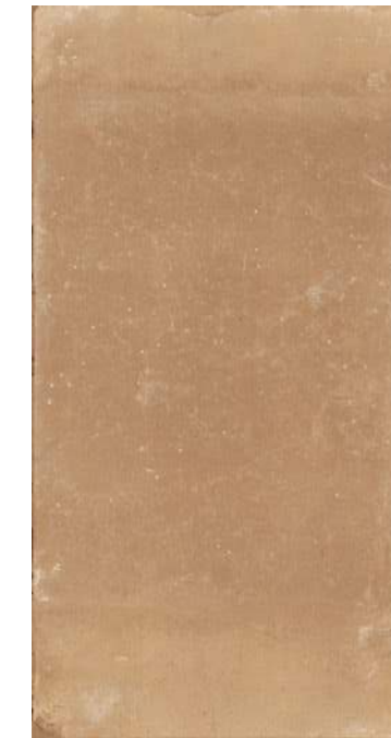
Cotto Rosso Outdoor 2CM 50x100 cm - 19,69"x39,37"