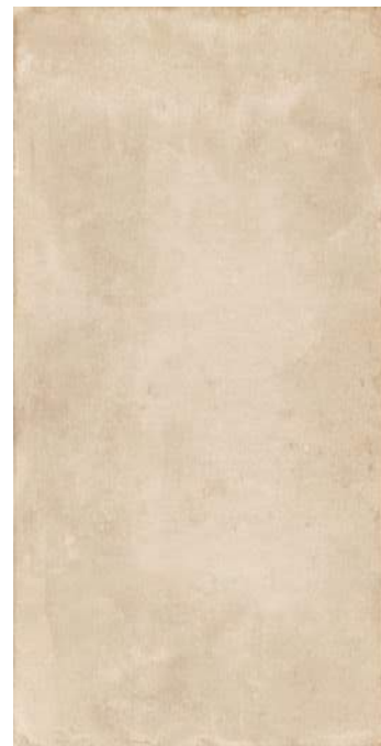
Cotto Sand Natural 50x100 cm - 19,69"x39,37" G-3140

Porcelánico Ángulo Recto Moderada Variación