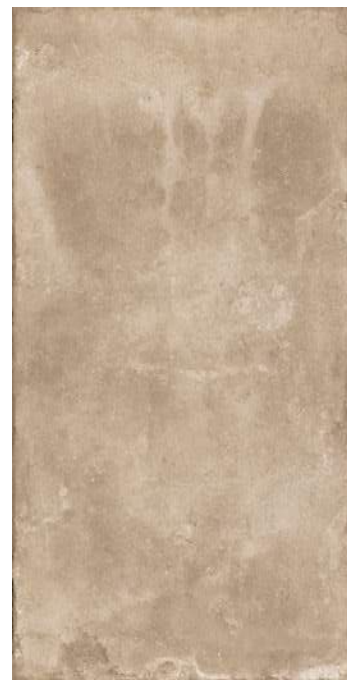
Cotto Brown Natural 50x100 cm - 19,69"x39,37" G-3140