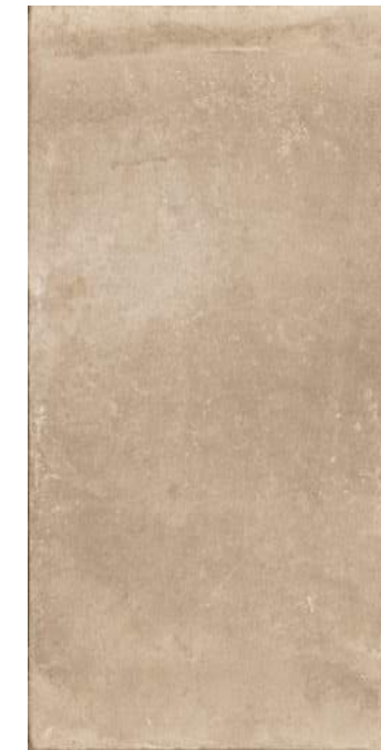
Cotto Brown Outdoor 2CM 50x100 cm - 19,69"x39,37"