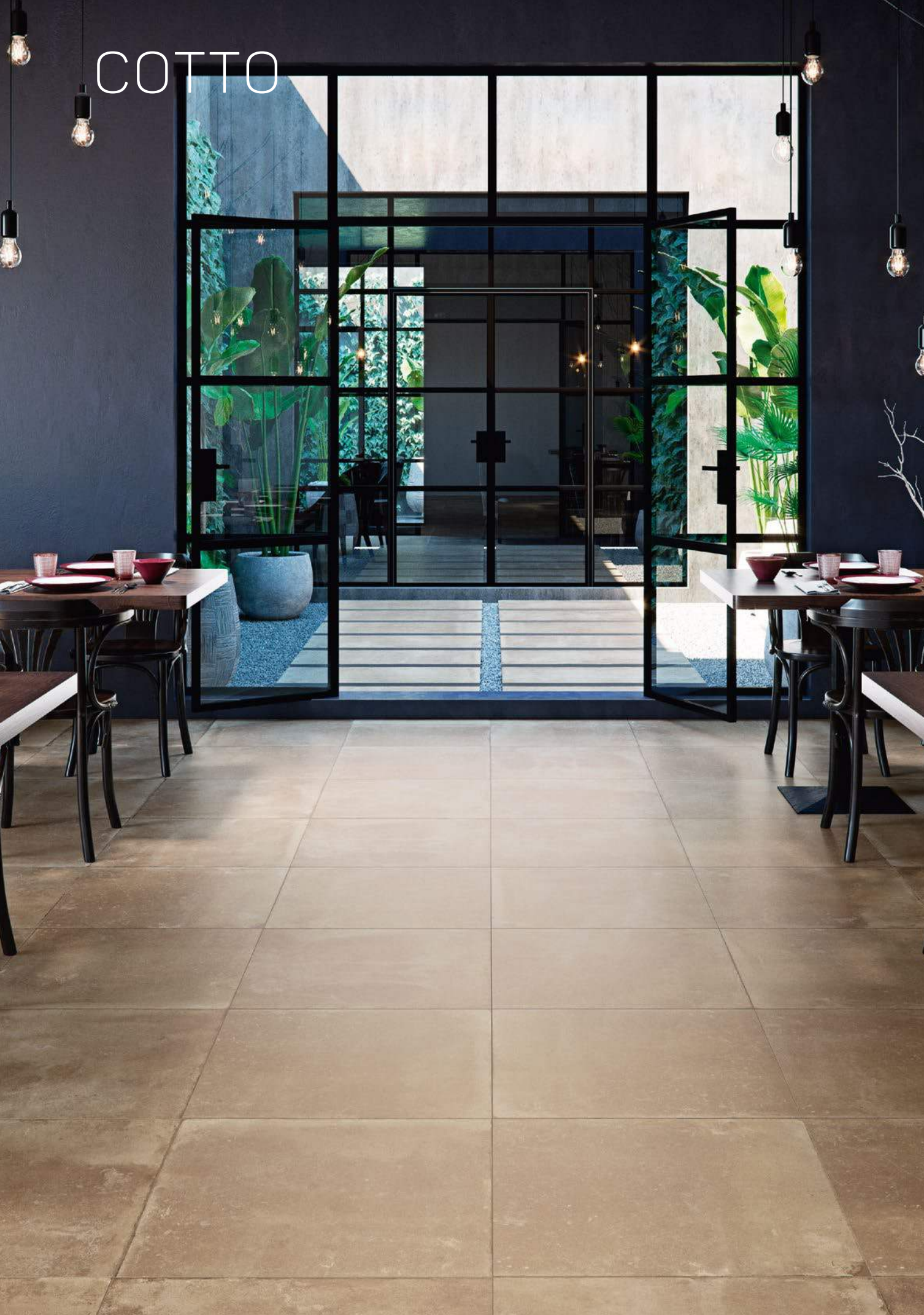
Floor: Cotto Brown Natural 59,2x59,2 cm-Cotto Brown Outdoor 2CM 50x100 cm